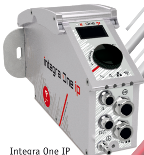
Integra One IP