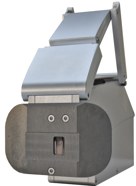
Integra One IP